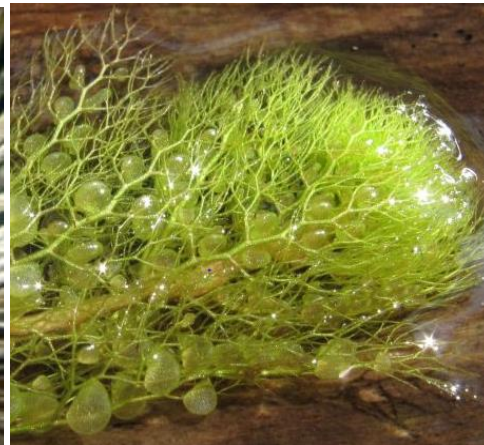
Figure 4: Native bladderwort

The three lakes of Kai Iwi, Taharoa and Waikare are basin type dune lakes formed over 50,000 years ago in consolidated sand of late Pleistocene geological origin that are ranked as nationally important geological sites (Kenny & Hayward, 1996; as cited in Smale et al., 2009). Formed by the accumulation of rainwater in depressions of sand underlain by relatively impermeable ironstone pans, the Kai Iwi lakes are some of the most pristine lakes in New Zealand for their water quality.