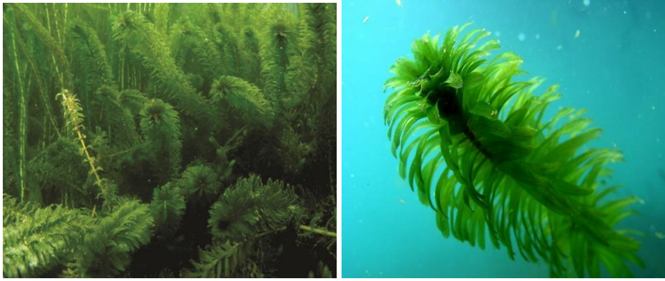
Figure 14: Egeria