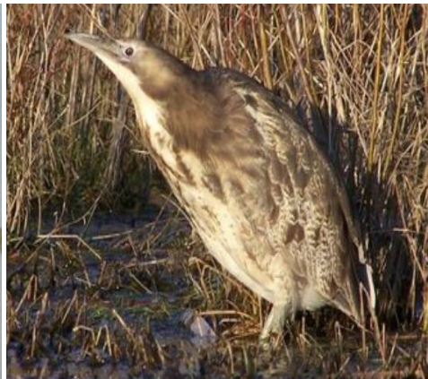
Figure 2: Australasian bittern