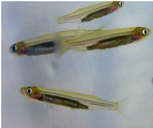
Figure 1: Dune lakes galaxias

Some are unique to this location such as the dune lakes galaxias, a non-migratory freshwater fish, other species are nationally endangered such as Trithuria which is amongst the oldest and most primitive flowering plants on the planet and native bladderwort ( Utricularia australis ) a small carnivorous plant. Also present is a diverse range of aquatic bird species including the threatened, nationally critical Australian bittern ( Botaurus poiciloptilus ) or matuku hūrepo.