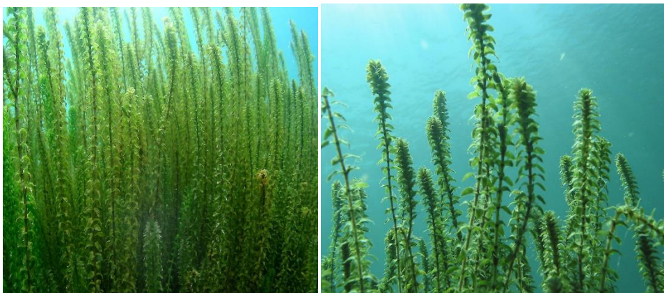
Figure 16: Elodea

The following management actions are suggested to maintain this status: