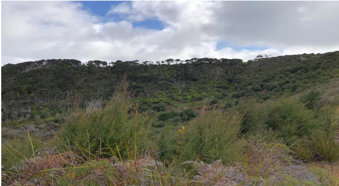
Figure 10: Native regeneration area Lake Taharoa

Naturally regenerating areas along with areas that have been revegetated are vitally important areas that both buffer and protect the lakes from activities such as runoff and sedimentation in the surrounding catchment and expand habitat for native plants and animals.