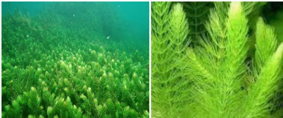
Figure 13: Hornwort

Maintaining limitations on motorised boat access and continuing advocacy, along with annual surveillance for plant pest incursions is essential to minimising the risk of invasive aquatic plants establishing. The combination of advocacy to educate users and early detection of incursions increases the chances of containment and eradication as well as decreasing the costs and impacts if such an event were to occur.