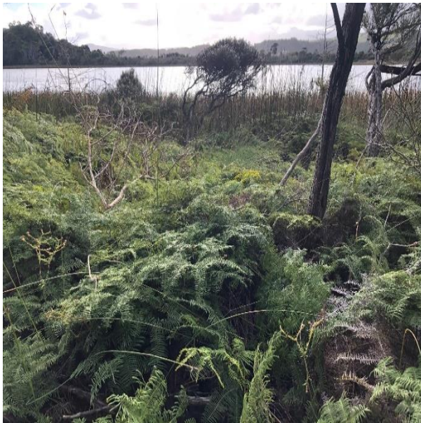
Figure 7: Typical lake edge -Lake Kai Iwi

Lake edges are generally where a lot of recreational activity is concentrated but it is also an area of diverse native vegetation communities with relatively few terrestrial and aquatic plant pests . Protection of vegetated lake edges is essential to deflect wave action, protect water quality and as habitat for native species both terrestrial and aquatic.