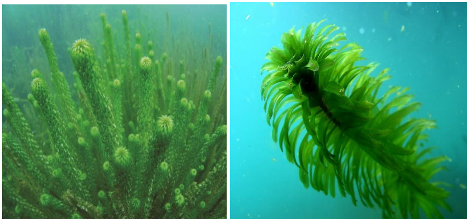
Figure 15: Lagarosiphon