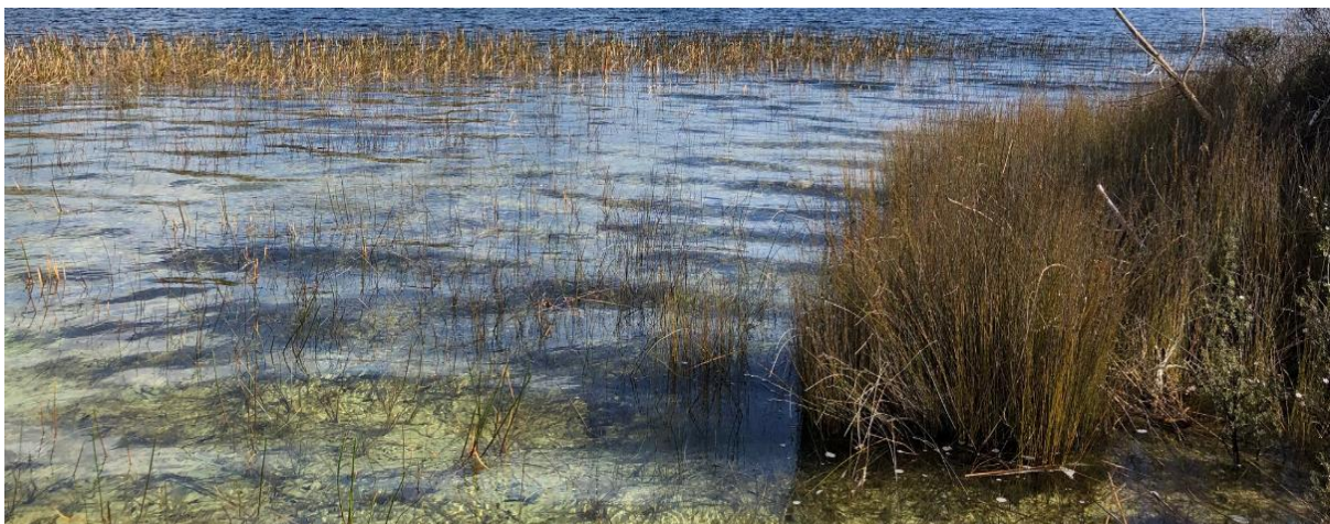
Figure 6: Lake Kai Iwi lake edge

Lakes Kai iwi, Taharoa and Waikare are outstanding Northland dune lakes with significant values. The lakes have excellent water quality and outstanding ecological condition, providing habitat for a range of endangered plants and animals. Lakes Taharoa and Waikare are major attractions with exceptionally clear water and white sandy beaches. They are popular for boating, sailing, kayaking, swimming, water skiing, camping, walking and trout fishing. However due to the easy accessibility and high recreational use of the lakes there is a significant risk of aquatic pest introduction, which could have a significant impact on the values of the area. There are already significant threats to the lakes from terrestrial weeds and pest animals (McKenzie, 2014).