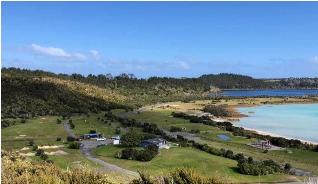
Figure 9: Amenity Zone: Pine Beach campground Lake Taharoa

The Kai Iwi lakes have a long history as a popular recreational area with many return visitors who come to enjoy the stunning natural surroundings and appreciate the family friendly opportunity to be able to stay for extended periods at the campgrounds administered by Kaipara District Council. Basic facilities (toilets, water, powered sites for motorhomes) are provided with an on site manager.