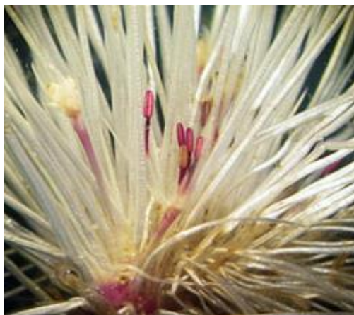
Figure 3: Trithuria