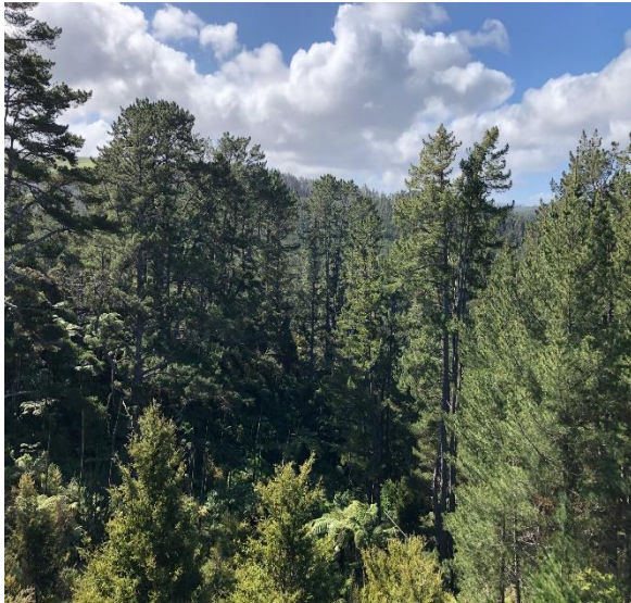
Figure 11: Wilding pine area