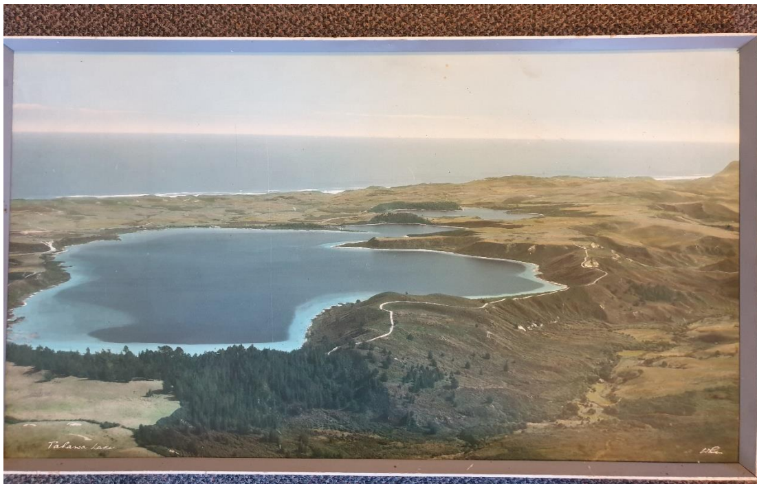
Figure 5: Lake Taharoa

From the 1920's onwards progressive purchase of land around the lakes resulted in 538 hectares of public scenic and recreation reserves with amenities to cater for increasing numbers of day and overnight visitors. Lake Taharoa is the focus of camping and much of the Kai Iwi lakes recreational activities. Lakes Kai Iwi and Waikare are less developed. However, management of the three lakes as one larger area effectively achieves integrated management of the natural environment and recreational activities.