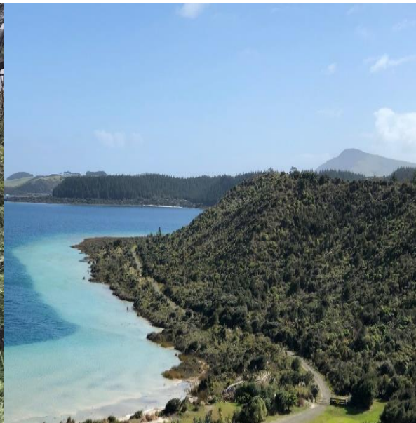
Figure 8: Management Zone 2 with track as boundary

The inner edge of the Lake Edges Zone is defined by the outer edge of lake side walking tracks and or/grassed or other vegetation (native and non native). In areas of native vegetation it is often characterised by waewaekaka, manuka, coprosma species, koromiko and neinei. Any management undertaken in this zone has been focused on the removal of invasive plant pest species to encourage native regeneration. These areas are limited to walking access only by way of series of narrow walking tracks down to lake edges or viewing points.