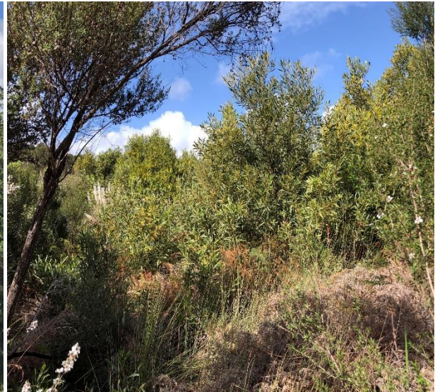
Figure 12: Regenerating wattle

The Pine Forest/Wattle/Wilding Pine Zone contains extensive areas behind all three lakes and is dominated either by dense wattle or wilding pine stands through which little native vegetation is evident. It also contains the remaining production pine plantation area on the northern side of Lake Taharoa and a wilding pine area on the southern side of Lake Kai Iwi which may also have harvest potential.