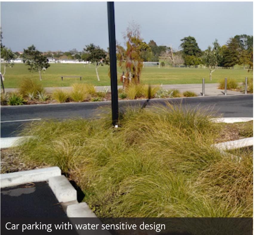
Car parking with water sensitive design