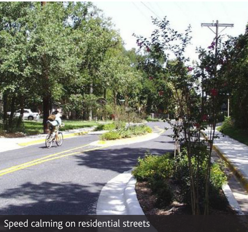
Speed calming on residential streets