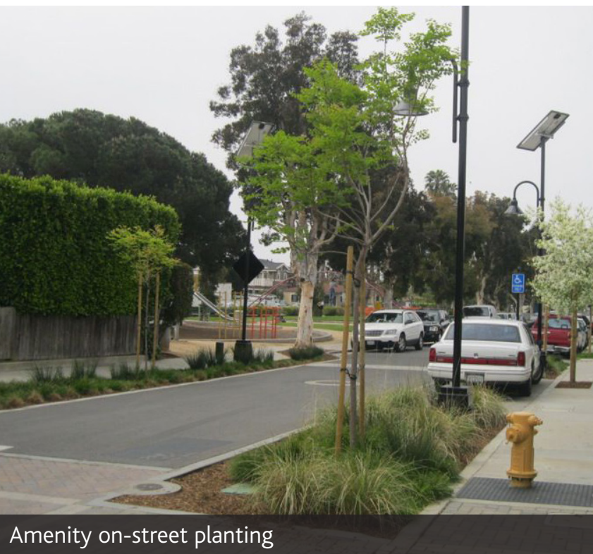
Amenity on-street planting