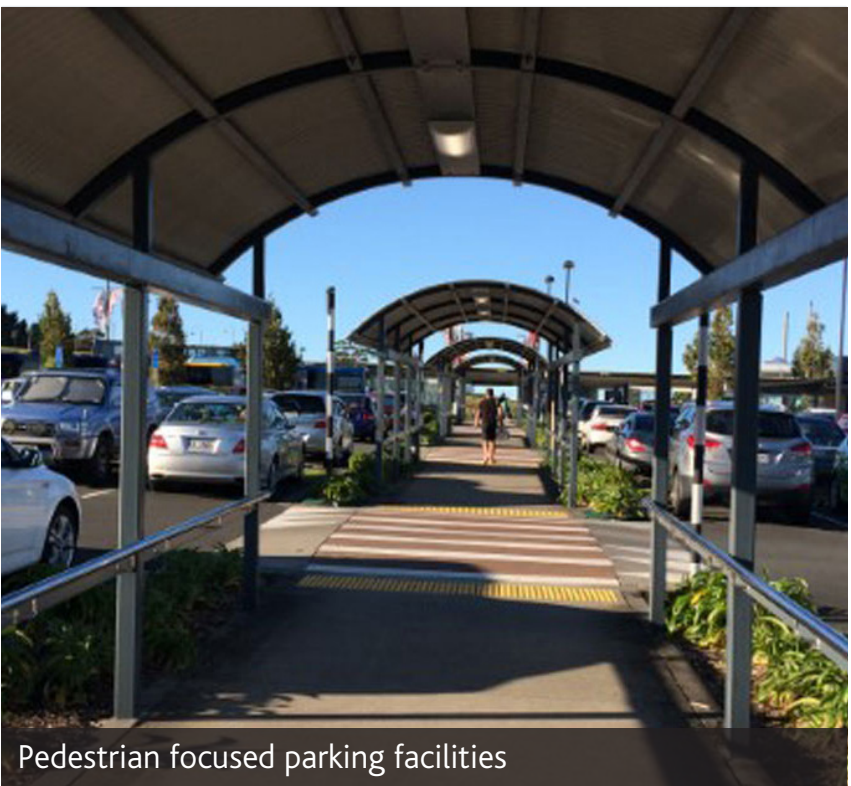
Pedestrian focused parking facilities