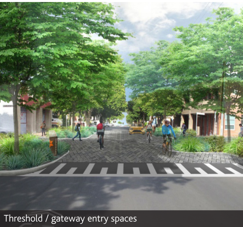
Threshold / gateway entry spaces