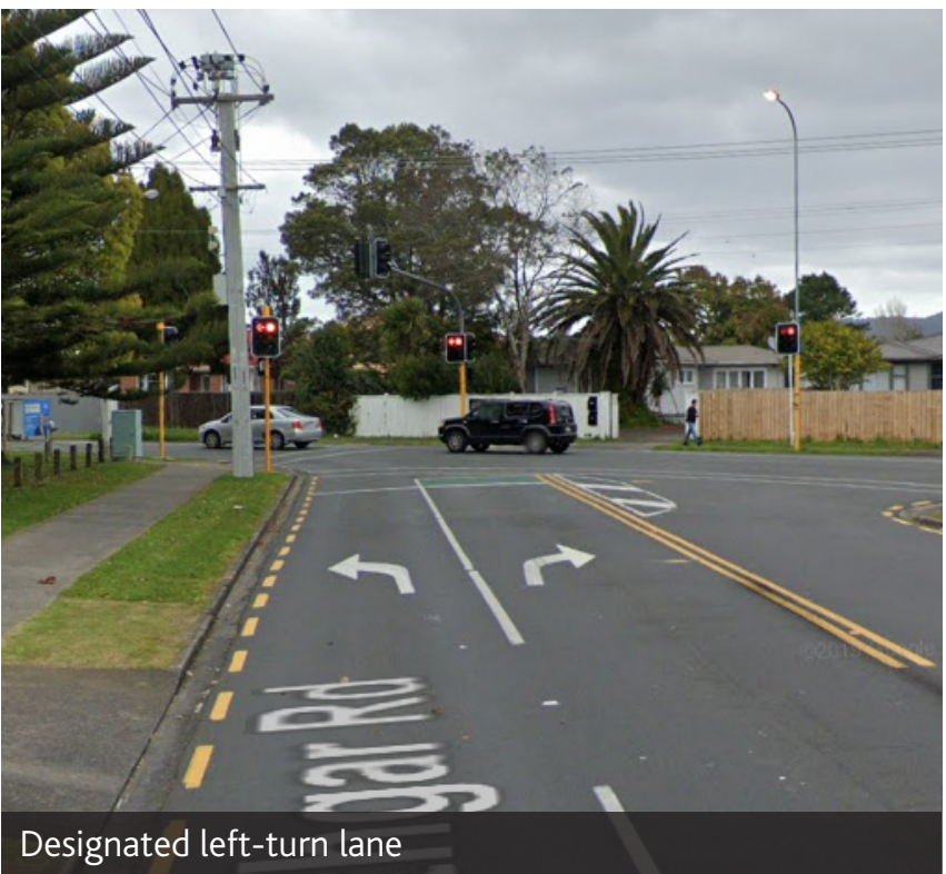
Designated left-turn lane