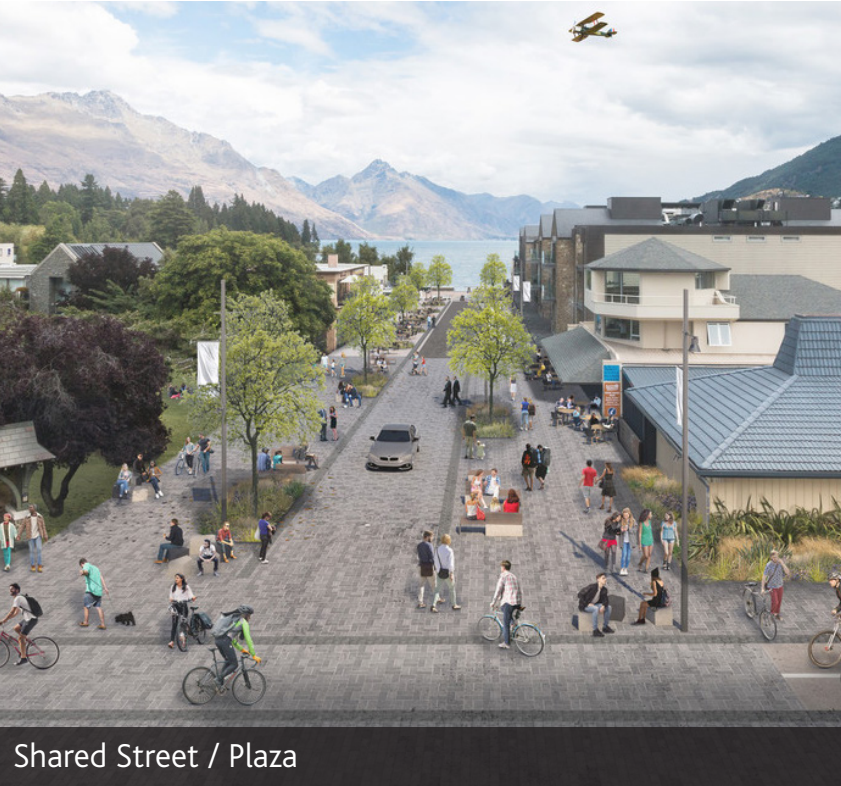
Shared Street / Plaza