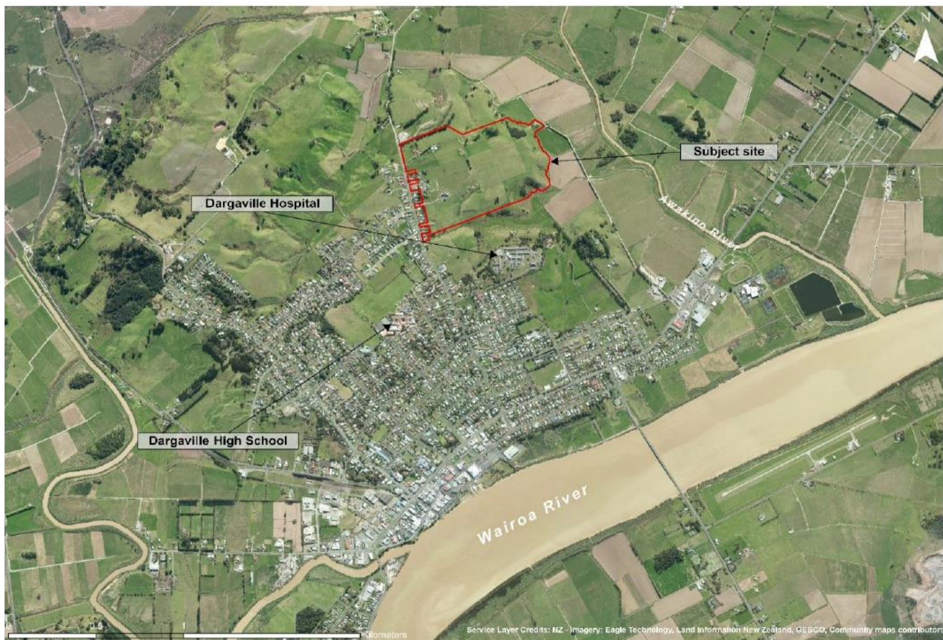
Figure 1: Showing the subject site in relation to Dargaville