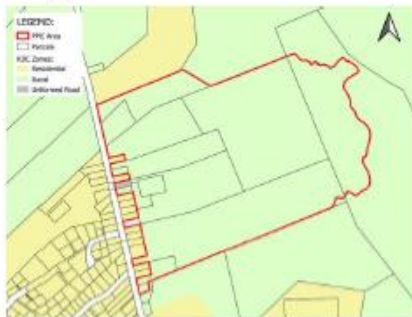
Figure 3-1: Existing Zoning

Figure 3-1 and Figure 3-2 below shows the proposal. The Rural Zoning is green and the Residential Zoning is Yellow.