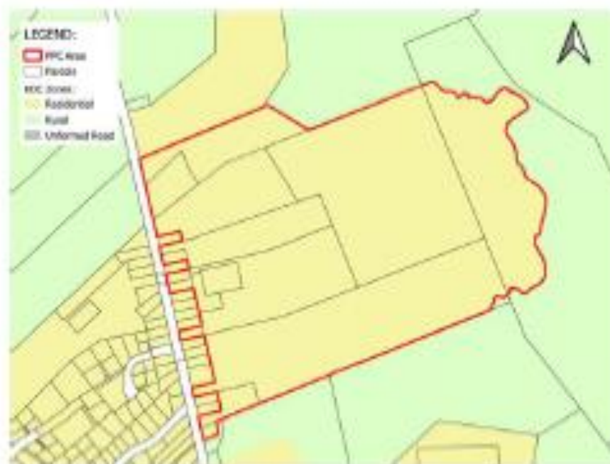
Figure 3-2: Proposed Zoning