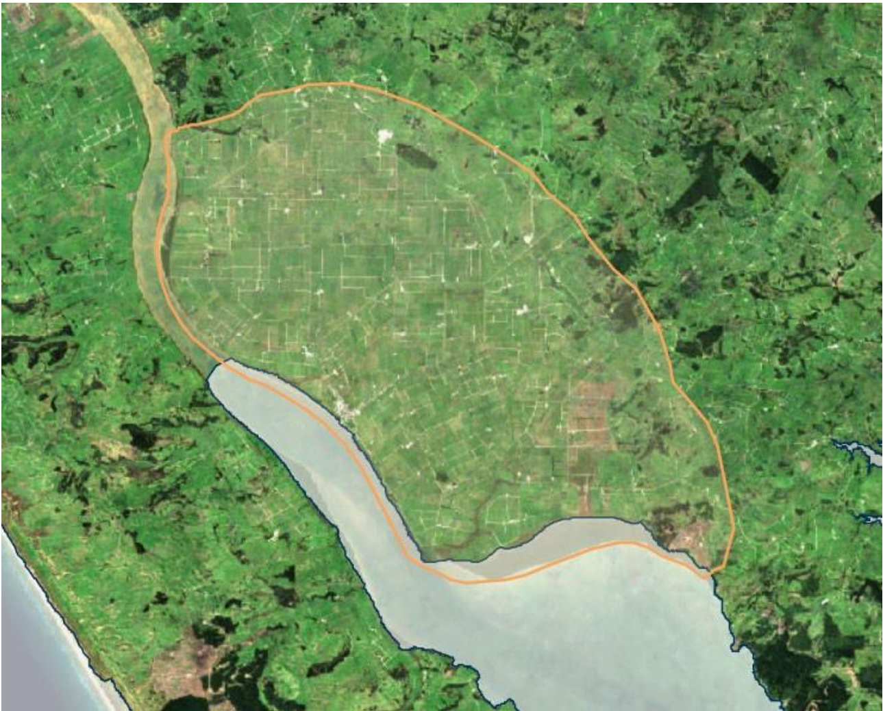
Figure 2 Ruawai Adaptive Pathways Physical Project Boundary

The community values and pathway objectives are step three on the planning cycle, and forms part of the answer to the, ‘What matters most?’ question (Figure 1).